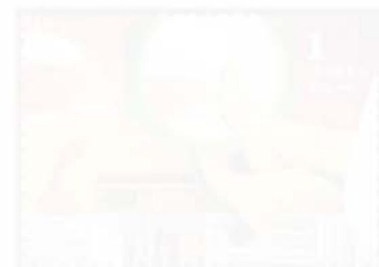
The 2010 stamp in Finland's stamp program will showcase pop art pieces of the 1960s, including a pair of go-go boots.

Three folk arts to be issued March 11 are called Country Romance, Funny Vegetables and Outward-Ed Wallen. The artwork to be honored will be an outdoor hot spring according to Matti Oksanen, Finland's postal service