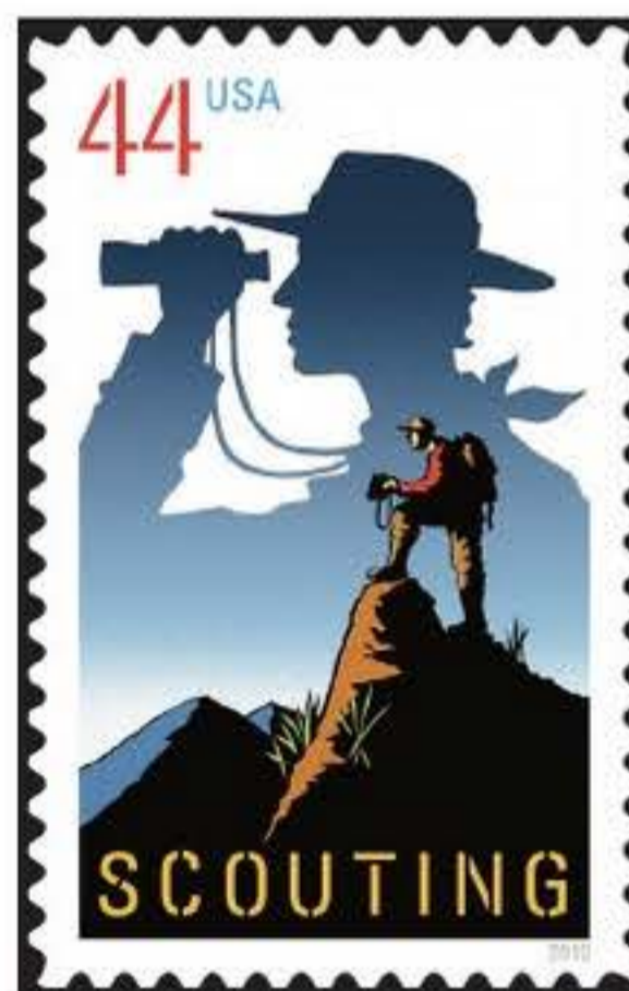
Two different images of a Scout create the design of the forthcoming U.S. 44¢ Scouting stamp. Tentative plans call for the stamp to be issued in July 2010.

The Postal Service will issue the stamp in July, in association with