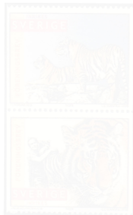
Swedish stamps to be issued Jan. 15 feature tigers that were raised by nature filmmaker Jan Lindblad on his Swedish farm.

In this wonderful venue on the beautiful island of Skeppsholmen in central Stockholm, the Modern Museum can now show the best of modern and contemporary art to growing