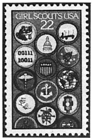
Figure 2. The normal 22¢ Girl Scouts stamp of 1987, picturing 14 merit badges (two shown only partially).

Figure 1. Plate block of four of the United States 22¢ Girl Scouts stamp with only the regular engraved colors printed. The block is part of a larger block of 46 stamps recently expertized by the Philatelic Foundation's expert committee.