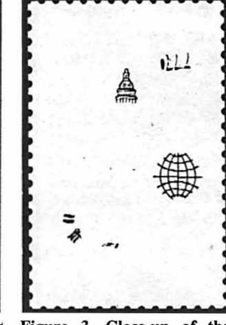
Figure 3. Close-up of the missing-offset Girl Scouts stamp from position 15 in the larger block of 46.

graving and Printing's combination offset/intaglio D press. A single plate printed both engraved red and engraved black, similar to how a single plate prints the red and blue on the current 29¢ Flag Over the White House definitive stamp.