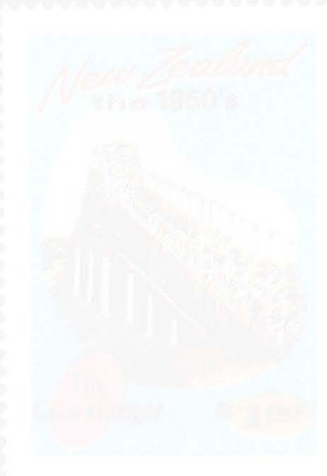
New Zealand will issue six stamps March 24 saluting the atmosphere and events of the 1950s, including rock 'n' roll, the conquest of Mount Everest, Aunt Daisy on the radio, the 1953 royal visit, a friendly dolphin and the opening of the Auckland Harbor Bridge.