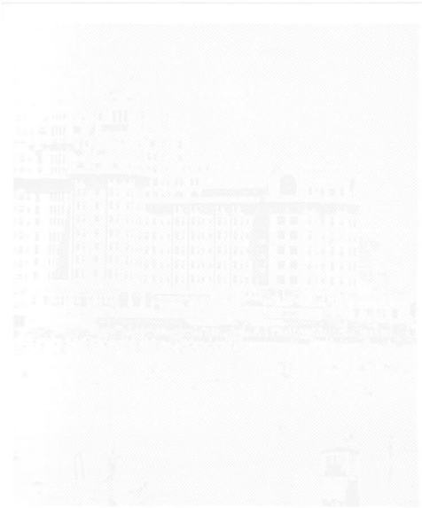
Atlantic City's Boardwalk at Illinois Ave., will April 14-15.