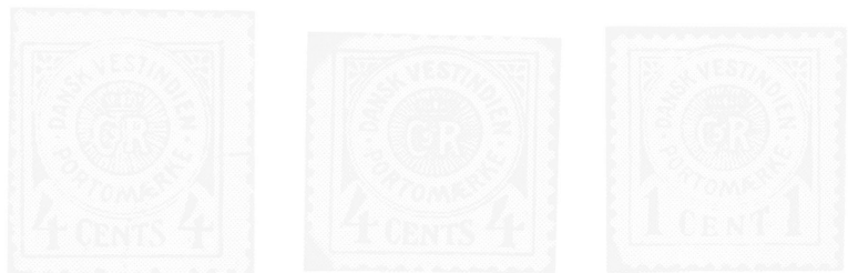
In the center above is a genuine stamp; its counterfeit is shown at the left, while at the right is a fake production of the 1c value of the same first set of Danish West Indies Postage Dues.