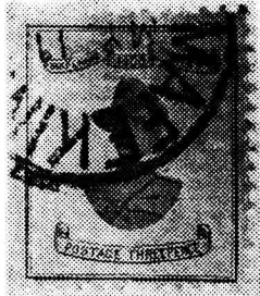
The First Baden-Powell Stamp Mafeking, April 10, 1900

In 1900 during the Boer War siege of Mafeking in South Africa, Col. Baden-Powell was first pictured on an improvised stamp, made as postage for local use as well as to amuse the garrison.