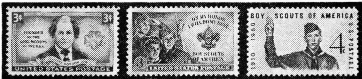
Juliette Gordon Low October 29, 1948