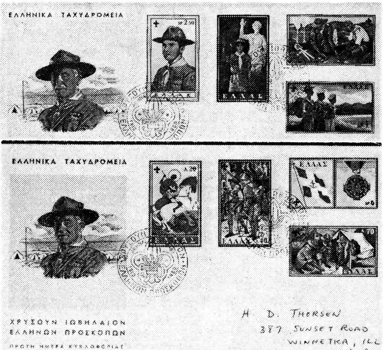
A beautiful philatelic tribute to Scouting is the eight-value set of Scout stamps issued by Greece April 23, 1960 as shown on the above covers from Mr. Thorsen's collection. Printed in multicolor, the lowest value 20 lepta shows St. George and the dragon, with the 6 Drachma top denomination depicting the Boy Scout flag of Greece and the Scout medal. The 30, 40, 50, and 70l. and 1 and 2.50Dr. show various Scouts and their activities.