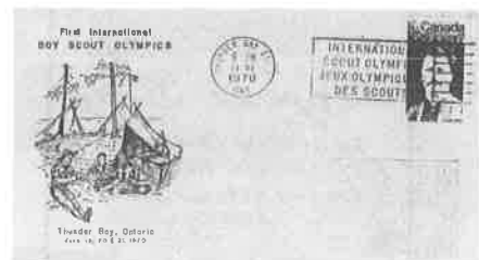
Canada Sc. 515, Louis Riel, First Day serviced with Scout Olympics cachet and slogan cancel.

The Port Arthur District Council of the Boy Scouts of Canada prepared this blue cacheted cover for use all three days of the Olympics. The Lakehead Cover Service of Thunder Bay used a number of these cacheted covers as First Day Covers for the Riel stamp. The illustrated cover was