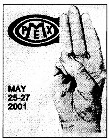
Figure 2: (Pictured To The Left) COMPEX Cachet for 2001 Show

Cachets were not a lot harder: the Boy Scout salute is an easily recognized emblem of scouting, that has appeared on a U.S. Stamp (Scott #1145). One of the members of the COMPEX Board provided the appropriate artwork.