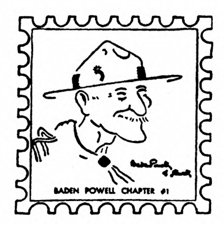
Figure 1. Logo of Baden-Powell Chapter #1 of SOSSI.