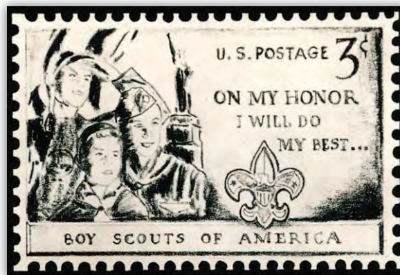
Poster for the 40th anniversary of the Boy Scouts of America (left) and sketch by the Boy Scouts of America that led to the design for the issued stamp.

ment. Unlike Schuck, Donaldson was more than welcoming and asked Rice to inform the national office of the Boy Scouts of America that if they were to contact the department armed with ideas for a design of such a stamp, they could expect favorable consideration.