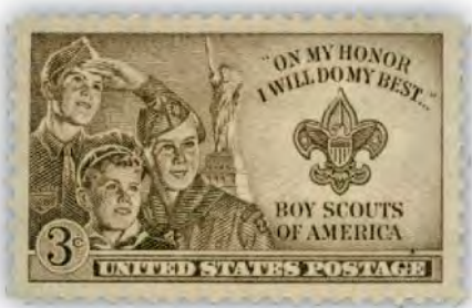
United States 3-cent Boy Scouts of America commemorative stamp.