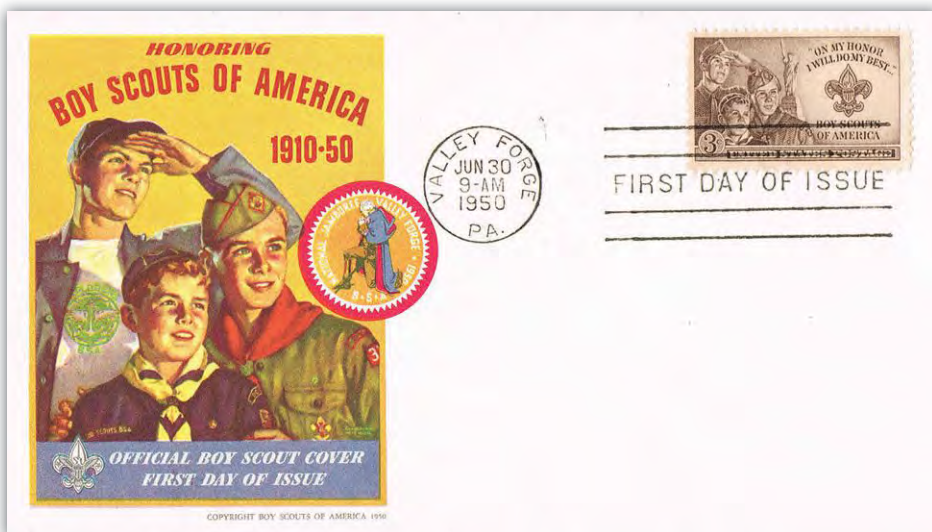
Official first-day cover for the Boy Scouts of America stamp.

On Saturday, the five special Jamboree camp post offices’