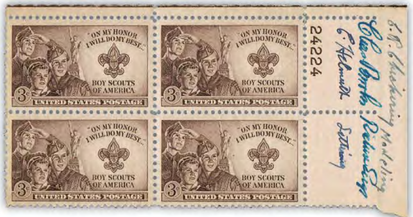
Plate block of the Boy Scouts of America stamp signed by stamp designer Charles Chickering, vignette engraver Charles Brooks, and frame and letter engraver Edward Helmuth.

During World War II, scouts collected 30 million pounds of rubber, distributed pledge cards for War Bonds and Savings stamps, collected aluminum and salvage, served as messengers and dispatch bearers, assisted emergency medical