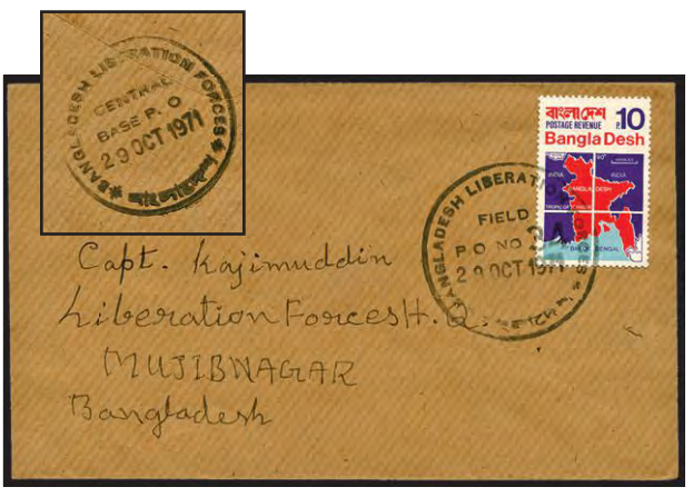
Bangladesh Scott 1 (issued July 29, 1971; Map of Bangladesh), used on military cover FPO 34, October 28, 1971. Backstamped at Central Base P.O. October 29, 1971.

For the sake of Humanity accept mail bearing stamps of "BANGLADESH"