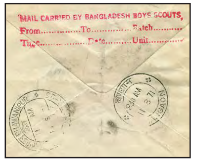
Censored cover carried by Indian Brigade and Boy Scouts.