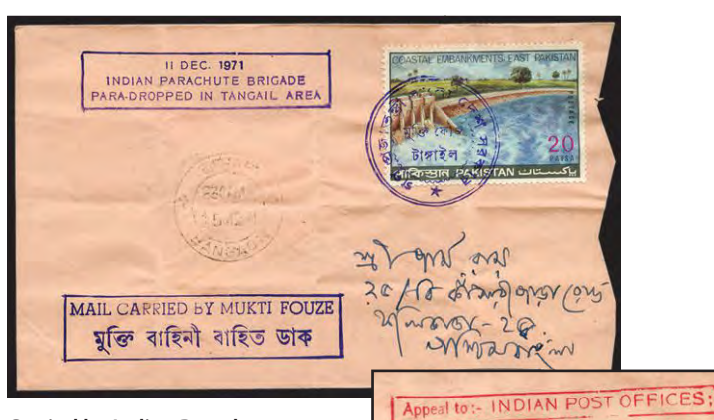
Carried by Indian Parachute Brigade.