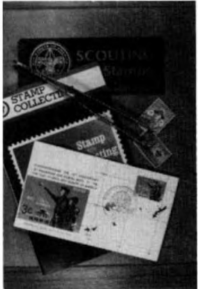
Above: Stamp collectibles pictured with the merit badge pamphlet and BSA stamp album include Scout stamps and firstday covers.